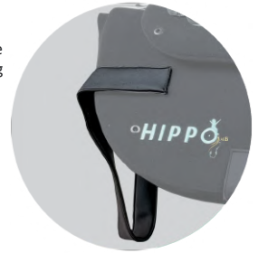
pic. 4: Crupper

Equipped with fastening system along the bottom surface in order to be easily attached along the top surface of the lower element. It is intended to stabilize the pad by preventing it from moving forward.