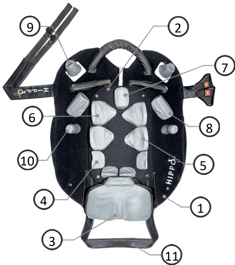
pic. 1: Hippo MB modular postural pad components