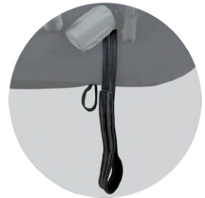
pic. 5: Footrest straps

Equipped with a hook-and-loop fastening system along the lower surface, in order to be easily attached along the upper surface of the lower element. Along its ends, the straps, will be equipped with two similar adjustable soft and flexible material rings to accommodate the feet of the end user.