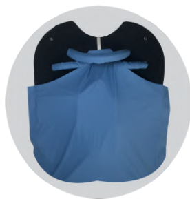
pic. 7: Hygienic protective cover

It is composed of a polymer fabric with combined PU/PES composition that is antibacterial, biocompatible, non-flammable, breathable, washable, sanitizable and sterilizable (consumable material). It is equipped with fastening system along the bottom surface in order to be easily attached along the top surface of the bottom element.