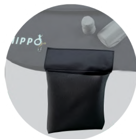
pic. 6: Storage pocket

Equipped with a fastening system along the bottom surface in order to be easily attached along the top surface of the lower element.