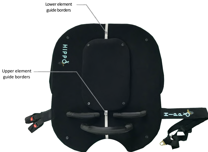
pic.3: Upper element

The upper element (pic. 3) should be the second component to be positioned. It should be placed on top of the lower element, taking care to visually check that it is perfectly at the center of the latter, with the help of the gray-colored guide borders on both components. Next, apply light pressure to the lateral and transverse areas of the upper element on the lower one to make the clinging systems of the upper element adhere. This operation contributes to the unloading of the end-user's weight on the horse, as well as to greater comfort for the end-user.