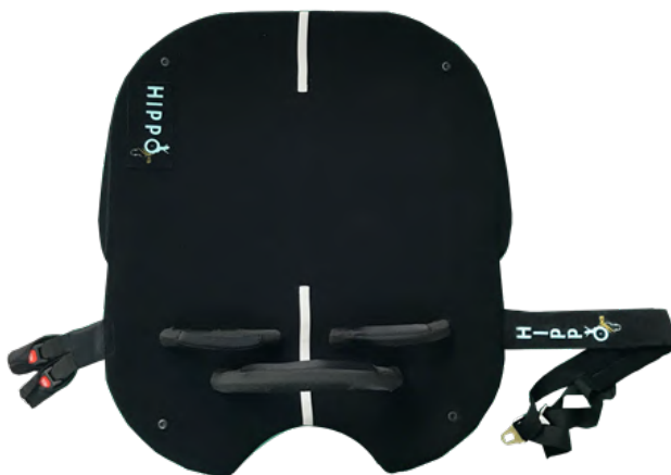
pic. 2: Lower element

The lower element (pic. 2) should be the first component to be positioned; it is created with a special material that can grip the horse's hair. Once positioned, use the appropriately tightened girth to secure the modular postural pad, preventing it from shifting during rehabilitation treatment.