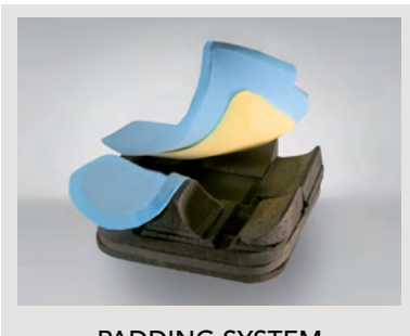
PADDING SYSTEM Free Shape