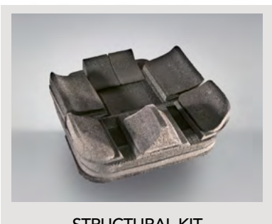
STRUCTURAL KIT MODULAR AND CONFIGURABLE